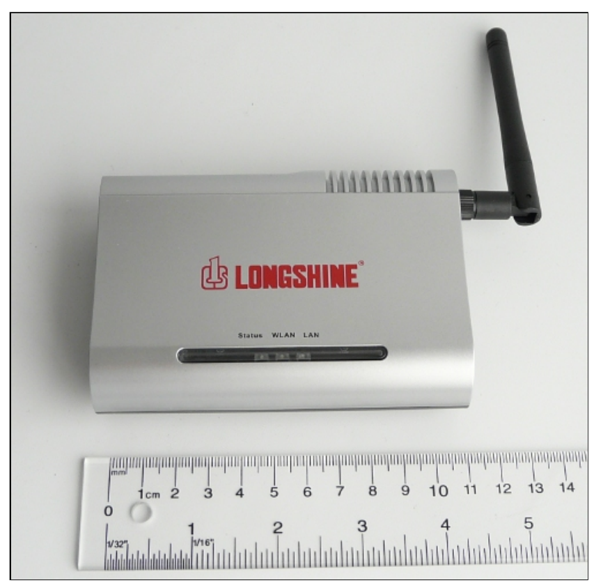
Longshine WA-45, works very well.

Here is how they look like. Most of them work very well.