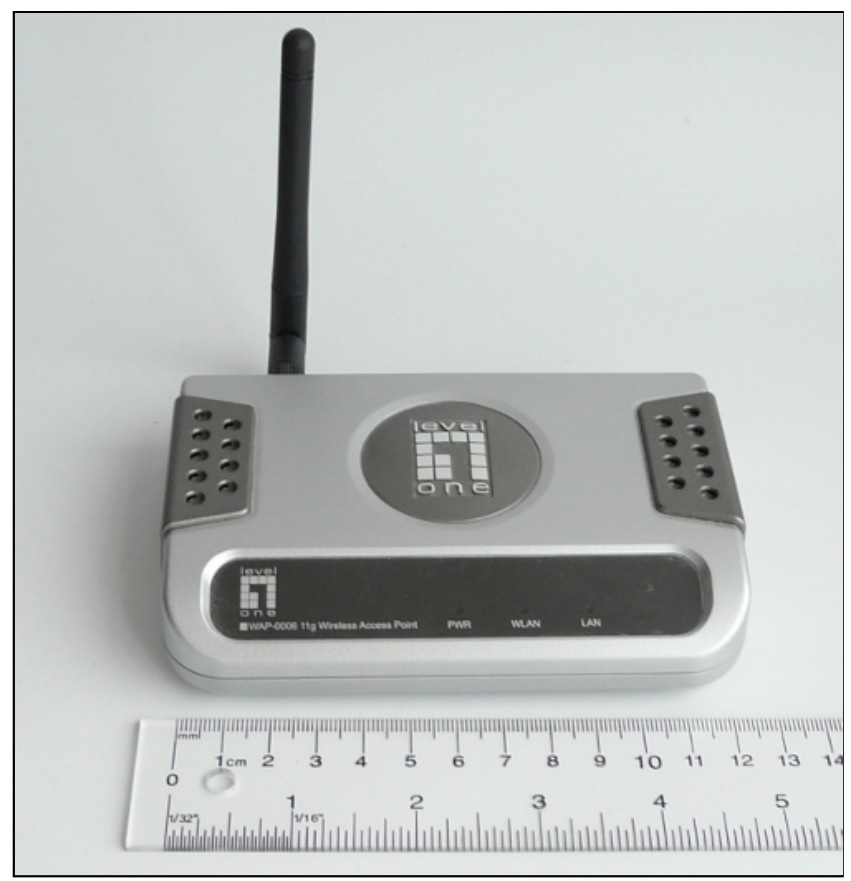
Level 1 wap0006, works very well.

A product to avoid is the D-LINK DWL-2100A. It can not be used to connect a server to a WiFi network as it does not handle initial Ethernet ARP broadcasts correctly.